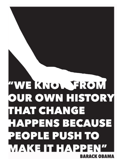
Illustration from 'A Gendered Profession' published by RIBA

Returning to the question of the profession, the LSA recognises that as the role of the architect in society has changed, so too must their education. They will need to be resilient, networked, proactive, resourceful, knowledgeable and prepared to be experimental. The quality of our future depends on them.