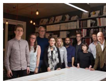
Project Orange Team Nov 2011

Project Orange 1st Floor, Cosmopolitan House 10A Christina Street London EC2A 4PA T +44(0)20 7739 3035 www.projectorange.com